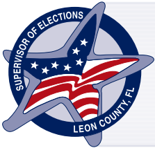
Photo and Signature ID

Our office and your polling place will be open 7 am to 7 pm on November 8 th , Election Day. All voters waiting in line at 7 pm will have the opportunity to cast a ballot. If you decide to wait until Election Day to vote, please check our website LeonVotes.gov for any last minute changes that might affect your ability to vote at your normal polling place.