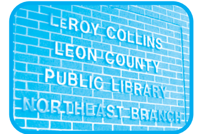
Northeast Branch Public Library