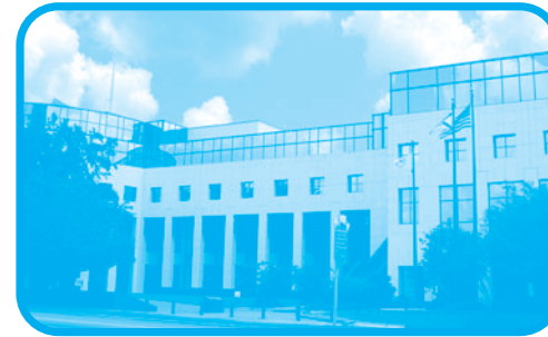
Leon County Courthouse